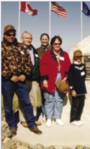
Approximately 17,000 landowners demonstrate the importance of the North American Waterfowl Management Plan at the farm gate.

The PHJV is an innovative partnership that shares its vision, resources and creativity for the benefit of waterfowl. With a renewed commitment by members and unwavering support from over 340 partners across the continent, the future of waterfowl conservation is in good hands today, tomorrow and in the years to come.